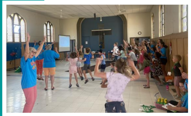
Music and movement are enjoyed by all.

from our congregation, while others came from neighbouring churches or the community. Teen leaders guided the kids be-